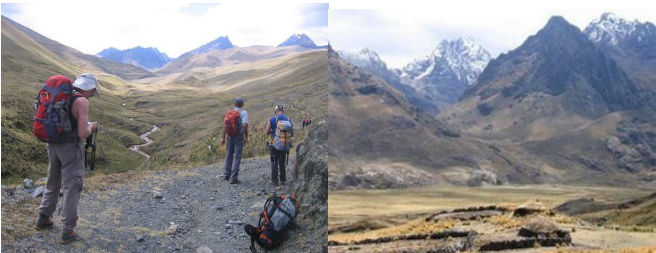
Beautiful Day One Hiking- Vast Sacracancho