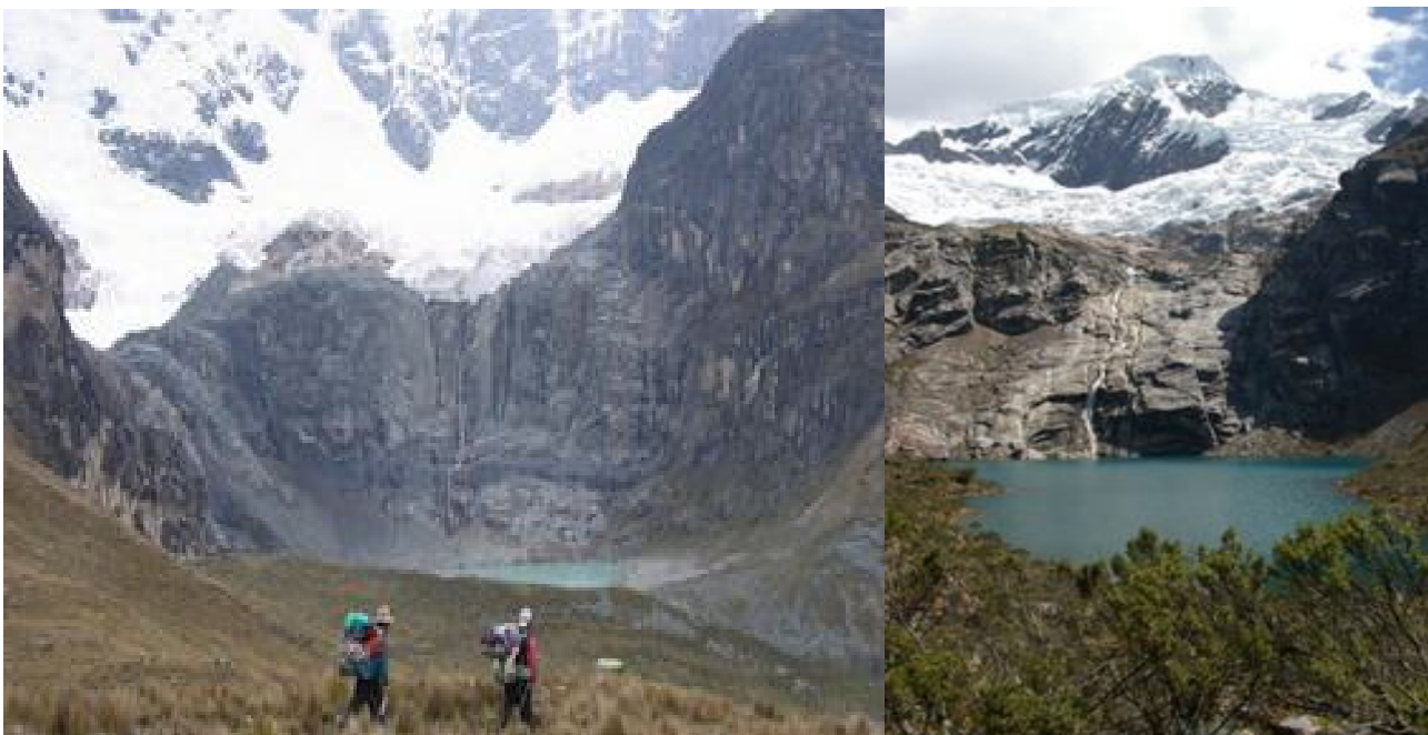
High Mountain Lakes & Glaciers