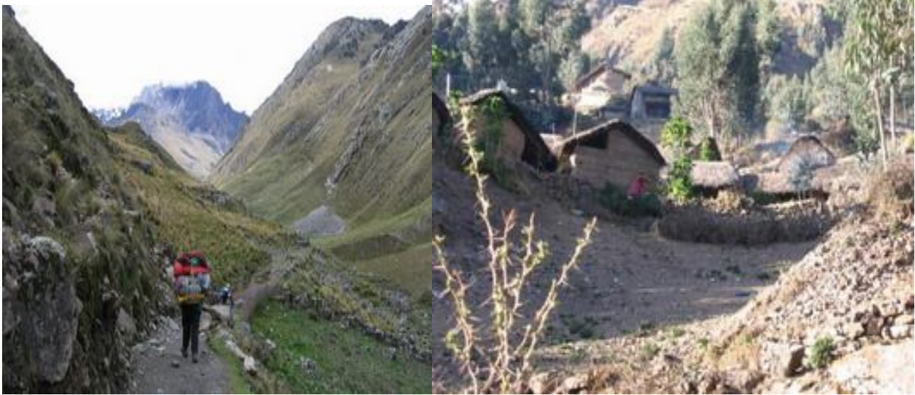
Remote Mountain Trails & Local Villages

We drive on a dusty route for an hour down to San Marcos & then to Chavin de Huantar where we will spend about two hours visiting the recently built Museum and then the archeological site and ruins of Chavin before we take the 3 ½ hour 109kms drive back to Huaraz, arriving around 7.00pm.