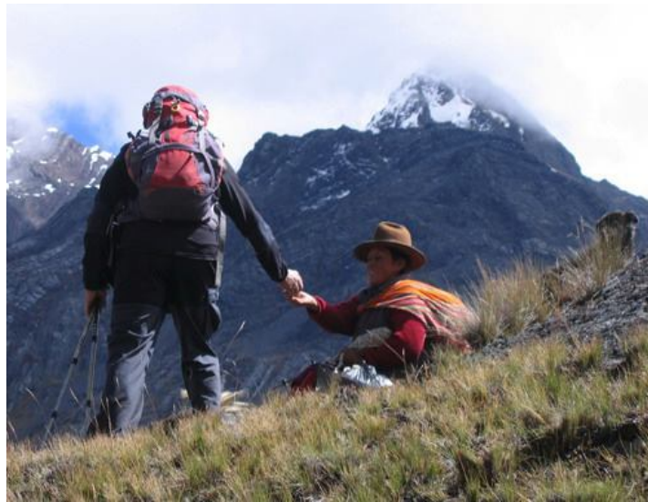
Local Shepherdess at Top of the Pass