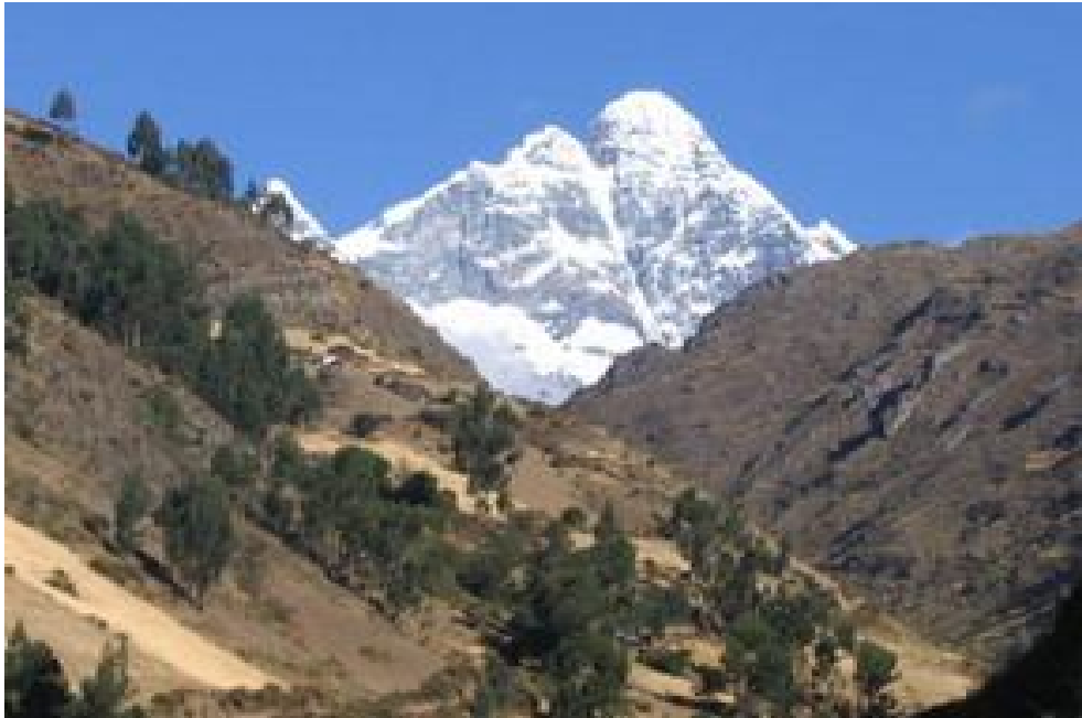
Huntsan Dominates the Skyline

pencils, note books, maybe some small children's fleeces to give to the families we meet, they would be gratefully appreciated) Approx. 12kms 5 to 6 hours