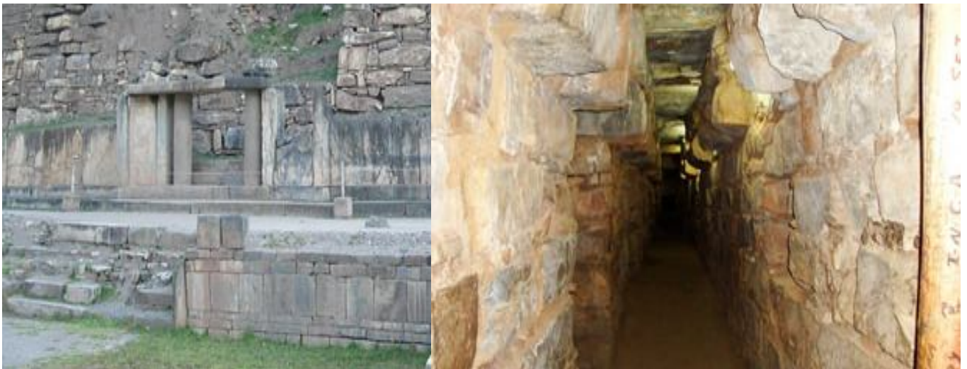
Chavin de Huantar