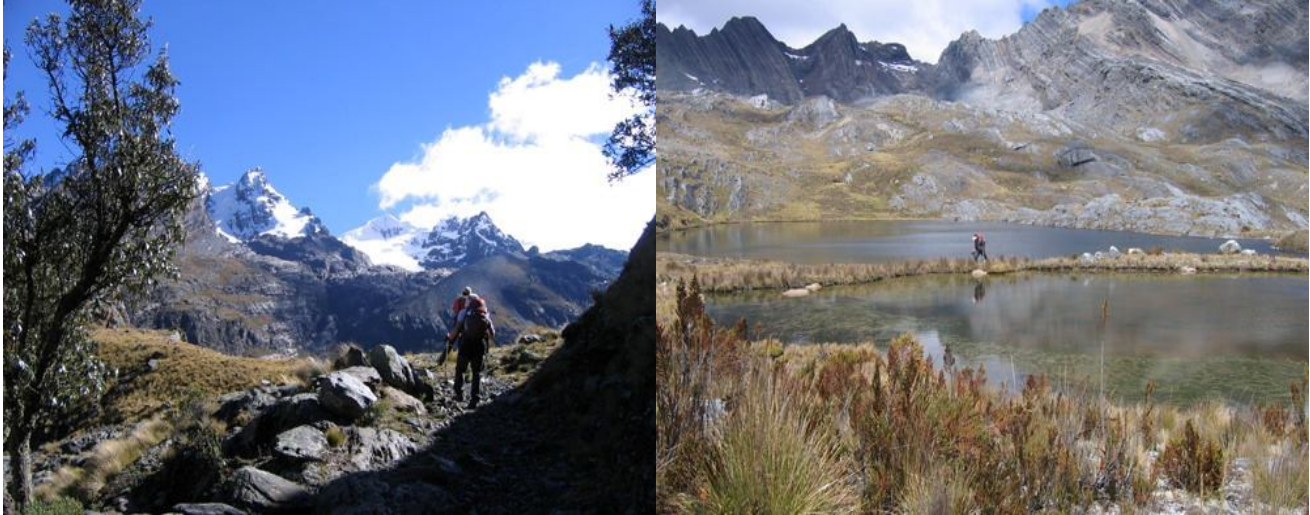
Pass Punta Yanashallash