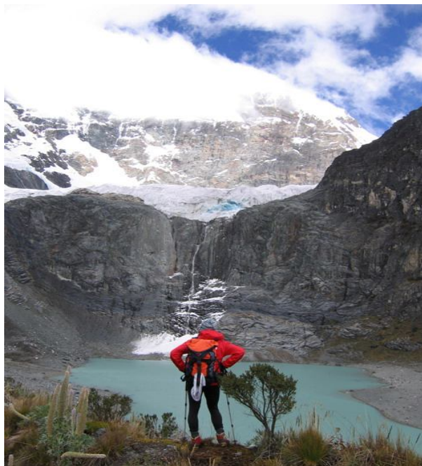
Tumarina Lake (Day 5 of Trek)

This trek offers an exciting mix of trekking through beautiful remote countryside with local culture and ancient history. If you would like to escape away from the busier more well know tourist trails into a remote area with hidden delights, then you will enjoy this trek.