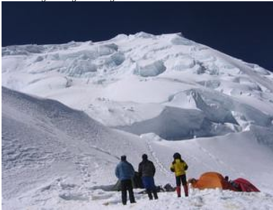
High Camp 2