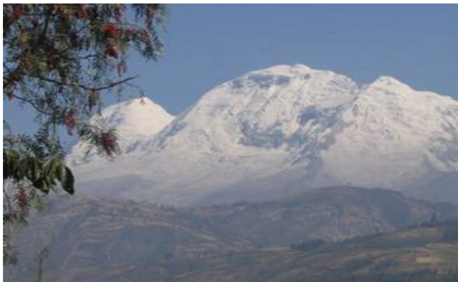
Huascaran as seen from Huaraz

Huascarán is the highest mountain in Peru, and the highest of any mountain situated in the tropics. It is the principal objective of many of the climbers that visit the Cordillera Blanca.