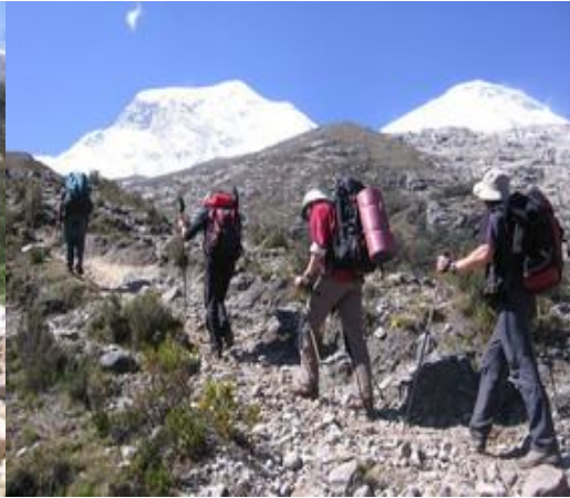
Hike to Base Camp