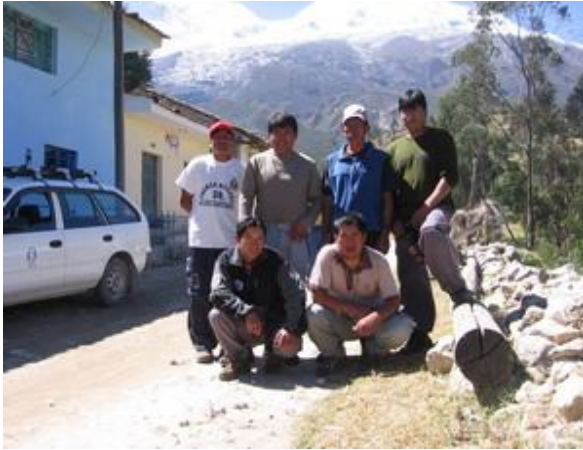
Our crew in Musho