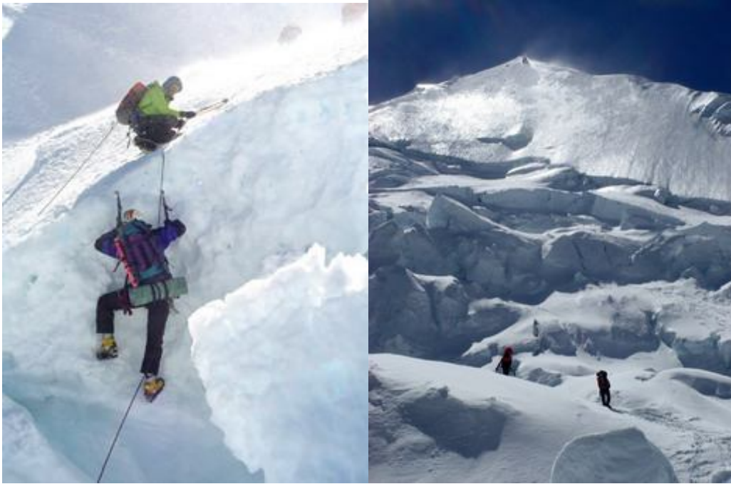
Negotiating the Garganta