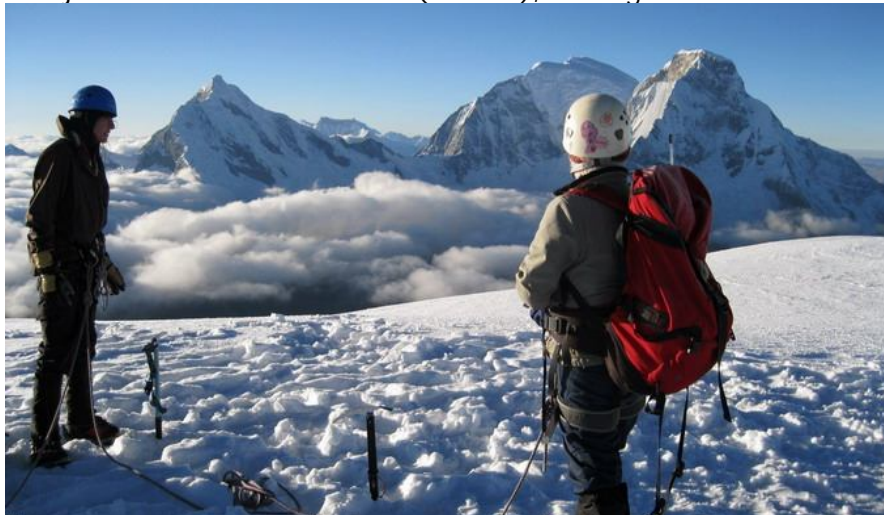
Pisco Summit, Admiring Huascarán Sur + Norte & Chopicalqui

Most years, there is no technical climbing on Pisco. Some years or months there are short, steep sections, some hard ice to negotiate or a crevasse to navigate around, but the guides would help you with this. Previous experience on snow and ice is not necessary. We can provide some basic instruction at Base Camp and support during the climb, but you do need to be strong to undertake this climb. From the summit you are rewarded with magnificent views of the many surrounding peaks, including the beautiful Chacaraju and massive Huascarán (6768m), the highest mountain in Peru.