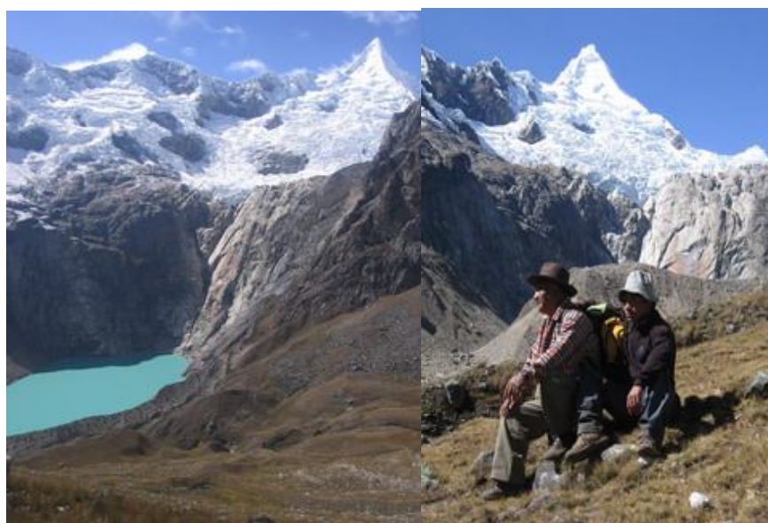
Laguna Jancarurish & Alpamayo