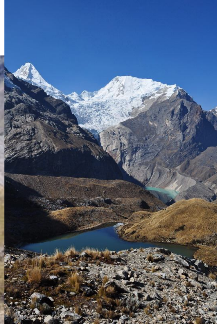
Cara Cara Pass