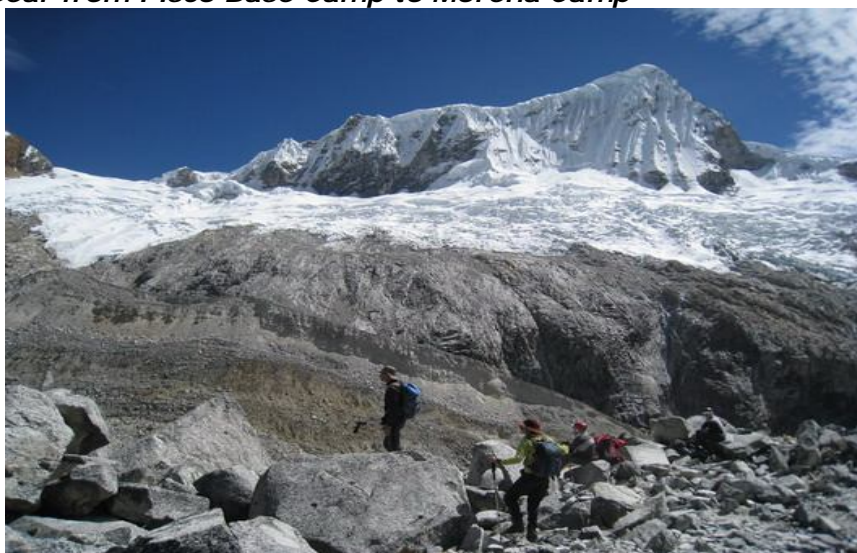
To Morena camp

Today is a short but challenging day. We climb to Morena Camp (4900m), crossing loose ground and negotiating large moraine rocks at times. The donkeys cannot come this way, so you need to carry your personal gear: climbing gear, clothes and sleeping bag. Porters carry tents, food, cooking equipment & ropes but you do need to be prepared to carry your own equipment. The ground today is uneven and rocky, and the hike commences with a steep but short hike up to the top of the moraine wall and then a short but tricky & steep descent down the other side. The rest of the way is a mixture of good path with some demanding scrambling over moraine rocks and loose ground. 3 hours.