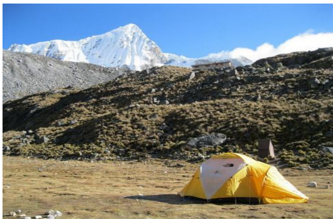
Pisco Base Camp, Pisco is Behind

food. Rest in the afternoon. Note: If you are a novice climber, we can organize some basic instruction in the afternoon.